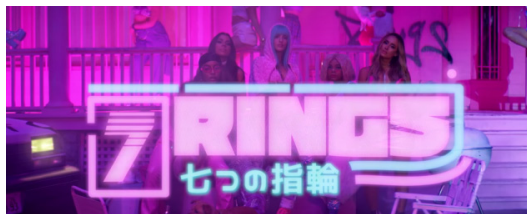
7 Rings logo from Ms. Grande's music video

30. Examples of Defendants' unauthorized posts depicting Ms. Grande's look-alike are included below, and attached hereto as Exhibit 3 :