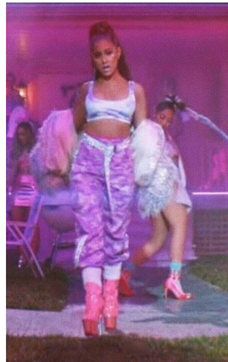
Image of Ms. Grande from 7 Rings music video