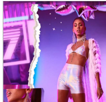
Forever 21's look-alike model with identical "7" in the background