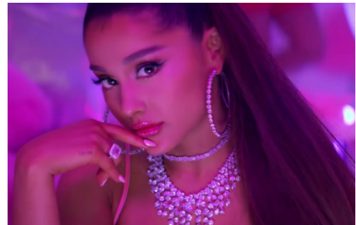
Images of Ms. Grande from 7 Rings video